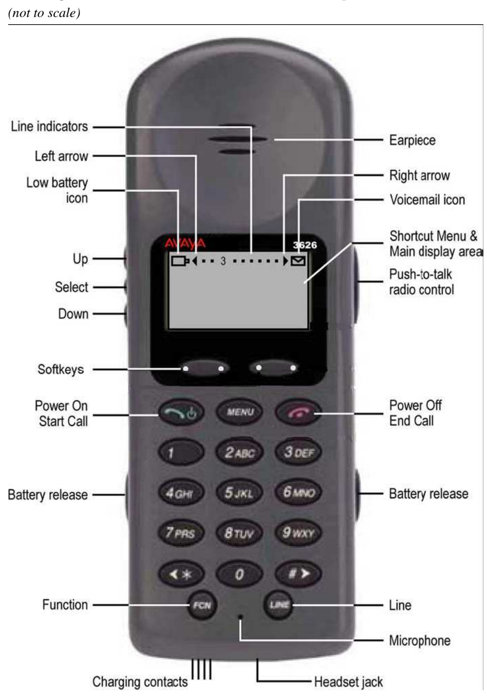
Page 15 of 47