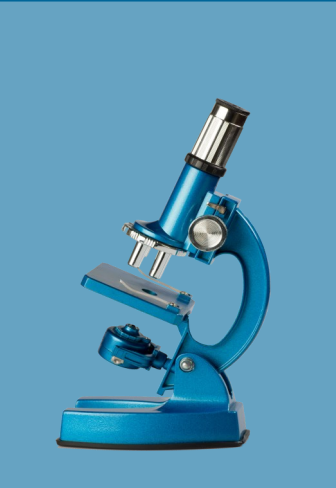
Spring 2017 Volume 40 Issue 1