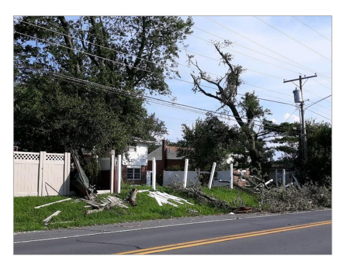
Tropical Storm Isaias damaged many properties on August 4, 2020, such as these homes on New Burton Road in Dover. Pruning trees can lessen damage from severe weather.