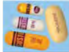
Sustiva (efavirenz or EFV)