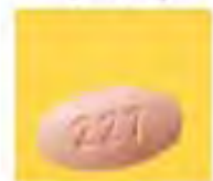
Isentress (raltegravir or RAL)