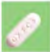
Combivir (zidovudine/ lamivudine)