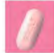
Lexiva (fosamprenavir or 908)