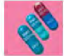
Reyataz (atazanavir or ATV)