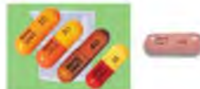
Zerit (stavudine or d4T)