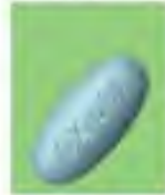
Trizivir (abacavir/ lamivudine/ zidovudine)