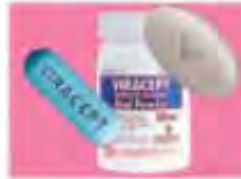
Viracept (nelfinavir or NFV)