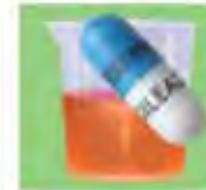
Emtriva (emtricitabine or FTC)