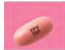
Aptivus (tipranavir or TPV)