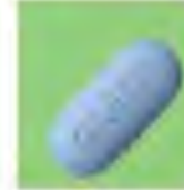
Truvada (tenofovir DF/ emtricitabine)