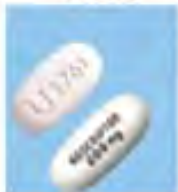
Rescriptor (delavirdine or DLV)