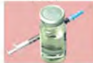
Fuzeon (enfuvirtide or T20)