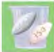
EpiVir (lamivudine or 3TC)