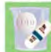
Retrovir (zidovudine ZDV or AZT)