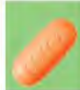
Epzicom (abacavir/ lamivudine)