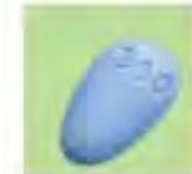
Viread (tenofovir DF or TDF)