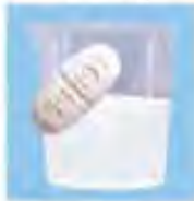
Viramune (nevirapine or NVP)