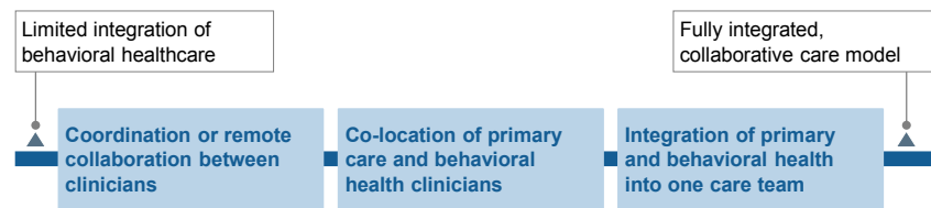
EXHIBIT 1. CONTINUUM OF APPROACHES TO BEHAVIORAL HEALTH INTEGRATION

The models of behavioral health integration fall into three categories along this continuum: